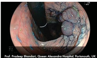
Fig. 1: Carpet adenoma of rectum

POSTOPERATIVE COURSE Repeat endoscopy at 2 weeks showed very healthy, almost healed EMR scar with mild narrowing of the lumen. Prophylactic dilatation was performed twice with no recurrence at 3 months.