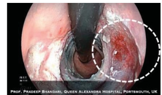
Fig. 4: Hemostasis was achieved